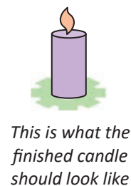
This is what the finished candle should look like